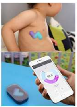
Fig. 7: Fever Scout Wearable Thermometer