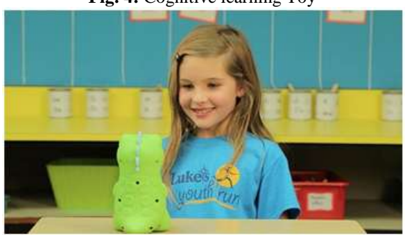
Fig. 4: Cognitive learning Toy

The developing of highly interactive academic and entertainment stuff was never easier before. The IoT has created the Application like IBM Watson, Amazon Lex, and others. It help to map the intelligence of users and provide dues as what to do to take learning to the next level.