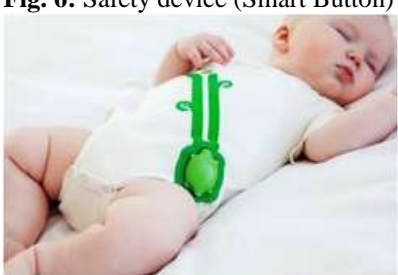
Fig. 6: Safety device (Smart Button)

If the baby rolls on her/his stomach it send immediately real time after to the application or to the nearby IoT Devices. The baby rolling on He/She stomach is not got for the babies. This IoT device is handy when you have babysitter and parent watching your baby.