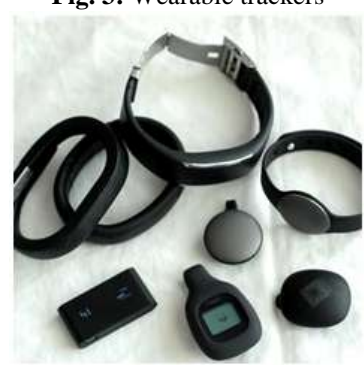
Fig. 3: Wearable trackers

To locate the kids IoT devices mostly uses the Bluetooth and GPS. The benefits of it as allows children more freedom while being watched, monitors children with special needs, who wonder helps monitor children with behavioral problems gives peace of mind to parents.