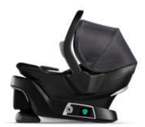
Fig. 5: For mothers self-installing car seat

The baby car industry is big business, the card has shown that almost 80% of the seat purchased are wrong install and fitted [7]. The self-installing car attach directly attach itself to the base of the seat. In it there is a robot in the base of the care seat so that it can install itself so that it can install itself, so that it cannot be install incorrectly. And it also has contribution after every time placement of child in it verifies the installation. It periodically it continues to check level and connections until the seat is removed. It provides the better child and kids softy while driving the car.